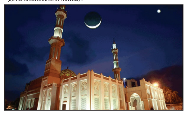
In New Zealand this year if the new moon is sighted sighting on Friday 17th July than the Eid al-Fitr will be celebrated on Saturday !8th July otherwise it will be celebrated on Sunday 19th July.

family and friends, give gifts (especially to children), and make phone calls to distant relatives to give well-wishes for the holiday. These activities traditionally continue for three days. In most Muslim countries, the entire 3-day period is an official government/school holiday.